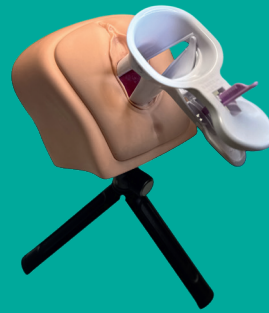
Cervix & Uterus